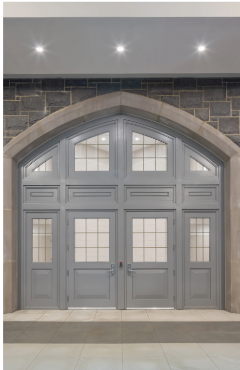
Blast Resistant Door & Frame West Point Military Academy