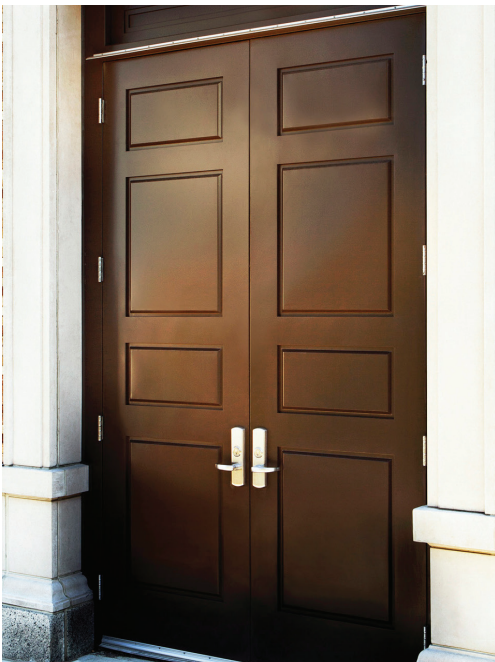
Recessed Panel Steel Doors Bronx Community College

As a world-class manufacturer of specialized frame, door and window assemblies, AMBICO supports wholesale distribution across our full line of products. Our sales team, including independent local representatives offers technical support and professional expertise from project concept to substantial completion. Our five-year warranty is a reflection of our product quality and business credibility.