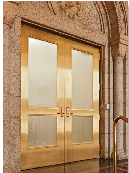
Bronze Clad Doors & Frame Victory Building

Our product list includes custom-built, engineered, and decorative assemblies. AMBICO's engineered frames, doors and windows are tested at renowned independent laboratories complying with the highest performance standards in the industry. Discerning architects and engineers rely on AMBICO to design and build frames, doors and windows suitable for their state-of-the-art buildings; our products are also found in iconic buildings around the globe.