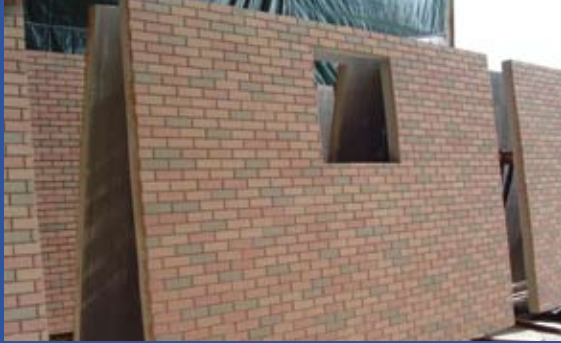
Precast Panel Color by Nawkaw

Nawkaw's Color Technology was developed to help contractors, builders and architects achieve consistent color in new construction, new additions, or where there were needed repairs to masonry surfaces. Nawkaw's products are now used for brick, block, mortar, stucco, stone, precast and tilt-up concrete projects. From custom color and textures to corrective color, decorative and total color changes , Nawkaw's precast stains are custom blended for your project's specifications. The process creates a bond with the surface, even when our textured stains are used, for seamless blending and extreme durability.