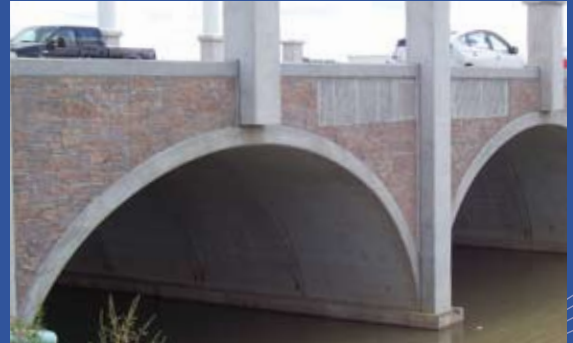
Precast Bridge Stone Color by Nawkaw

Visit our website at www.nawkaw.com for locations and additional project photo galleries. We also offer downloadable specification sheets for our products. Please contact your local Nawkaw Representative for more information.