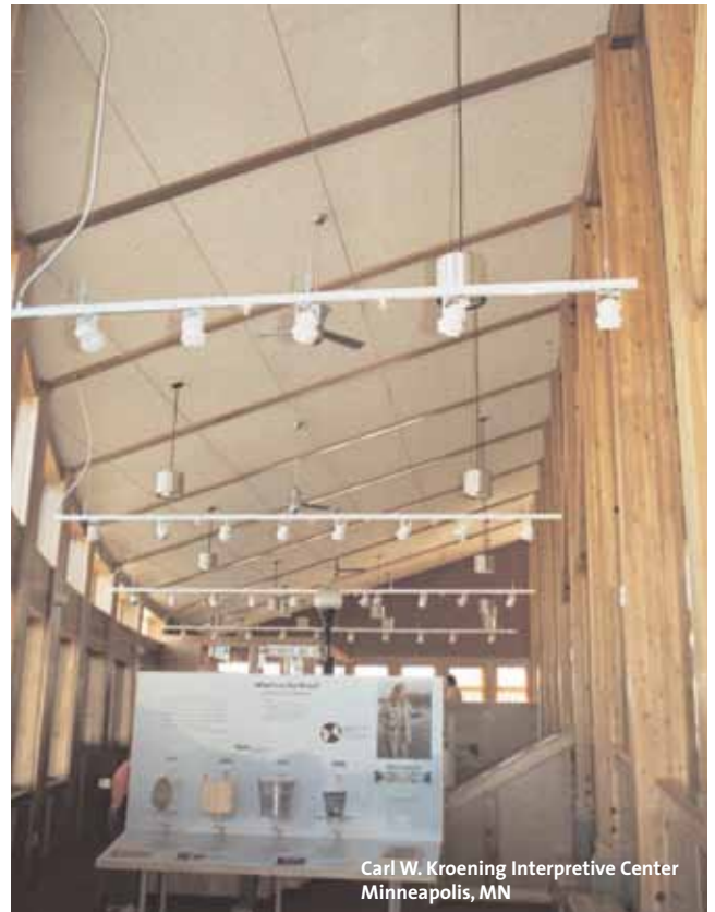
Carl W. Kroening Interpretive Center Minneapolis, MN

THERE IS NO ASBESTOS, NOR HAS THERE EVER BEEN ANY ASBESTOS, USED IN TECTUM PRODUCTS.