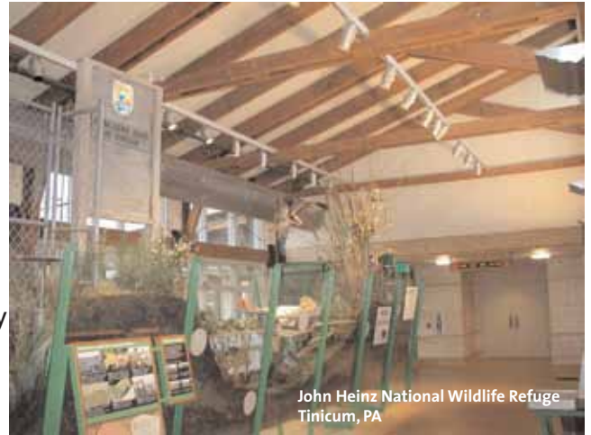
John Heinz National Wildlife Refuge Tincum, PA

Tectum panels provide acoustical treatment when abuse resistance is also a priority. The panels are manufactured in an environmentally friendly process from sustainable raw materials and can be renewed by repainting and reused by demounting. They will last for years, and waste may be safely deposited in landfills. Tectum products continue to meet the needs of owners, architects and building industry professionals who require green building products.