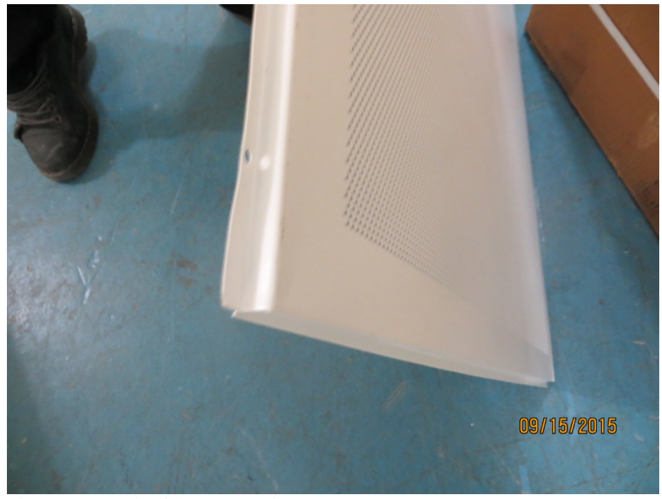
Figure 2 – Detail of the test specimen.