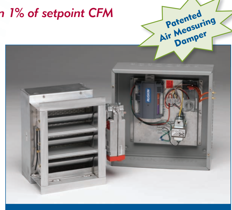
IAQ50X shown with standard factory controls

The IAQ50X is the most sophisticated air measuring and control device in the industry. It calculates flow based on a combination of differential pressure and blade position. Each unit is factory tested on Ruskin's wind tunnel. A relationship to flow and blade position is established during the full range calibration process. The controller determines flow by comparing the differential pressure and blade position to a lookup table in the programming code. This precise method of measuring airflow is what allows us to read down to 150 feet per minute. The programming code is safe within a nonvolatile EPROM format to protect loss of data during a power outage.