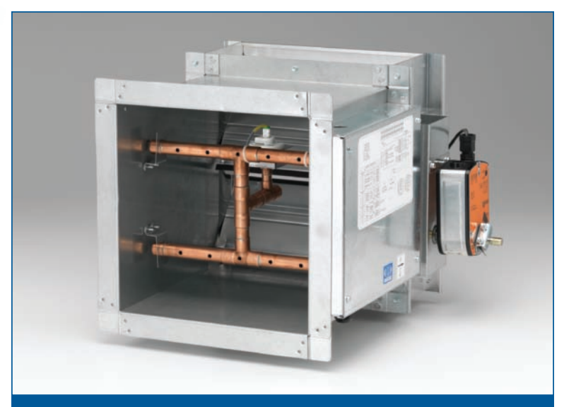
EAMS060 with standard actuator and factory controls

The EAMS060 combines the precise measurement of the AMCA certified EAMS series air measuring station, with Ruskin's ultra low-leak, class 1 control damper, the CD60. The controller is factory calibrated and programmed to operate the damper actuator to the desired cfm setpoint. As the air scoop manifold pressurizes, it directs flow over a high performance, heated mass flow sensor housed in a sensor chase. This arrangement protects the sensor from moisture and airborne debris. The EAMS060 is ideal for measuring and controlling outside air.