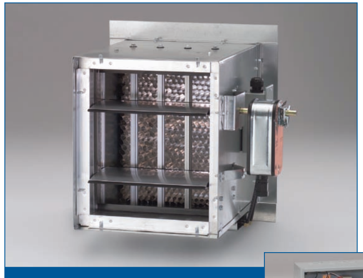
AMS050 shown with optional actuator

The AMS050 combines the precise measurement of the AMS air measuring station with an AMCA certified, ultra low-leak, class 1 control damper the CD50. The unit comes completely factory assembled,