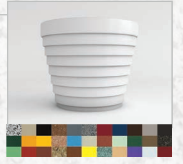
*For color names and clarification, please refer to PAGE 1 or visit WWW.TERRACASTPRODUCTS.COM