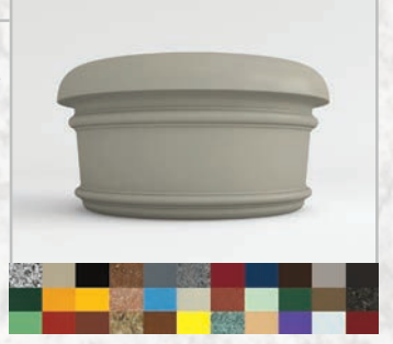
*For color names and clarification, please refer to PAGE 1 or visit WWW.TERRACASTPRODUCTS.COM

The rugged oversized lip design is a popular choice for municipalities and parks across the country. This muscle planter balances a bold look and soft lines to enhance installations.