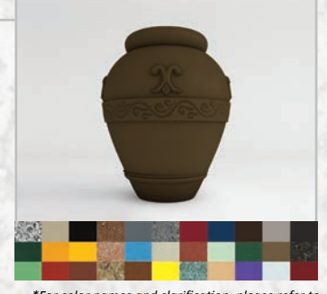
*For color names and clarification, please refer to PAGE 1 or visit WWW.TERRACASTPRODUCTS.COM

This classic style is used both vertically and horizontally. Beautiful Italian details of handles and swirls define this architectural accessory. Available in two sizes to create high-low and large-small effects.