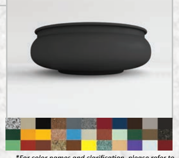
*For color names and clarification, please refer to PAGE 1 or visit WWW.TERRACASTPRODUCTS.COM