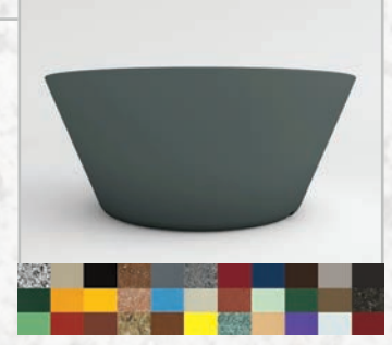
*For color names and clarification, please refer to PAGE 1 or visit WWW.TERRACASTPRODUCTS.COM