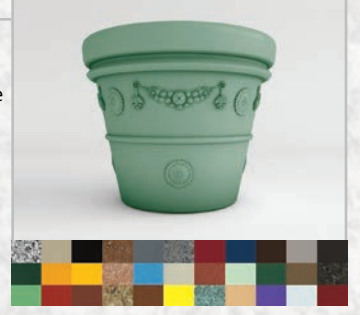
*For color names and clarification, please refer to PAGE 1 or visit WWW.TERRACASTPRODUCTS.COM

Detailed garland accents this traditional Italian staple. Rolled rim and tapered design make this a popular choice.