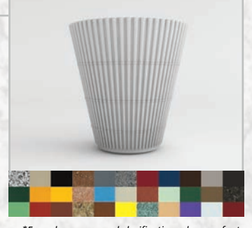
*For color names and clarification, please refer to PAGE 1 or visit WWW.TERRACASTPRODUCTS.COM

Holistic Asian garden design, with round, cylindrical, fluted, tapered design.