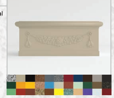
*For color names and clarification, please refer to PAGE 1 or visit WWW.TERRACASTPRODUCTS.COM

Decorative bold lip and traditional Italian garland design define this industry favorite.