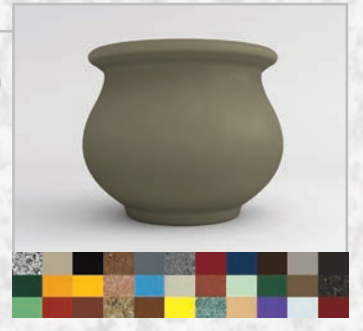
*For color names and clarification, please refer to PAGE 1 or visit WWW.TERRACASTPRODUCTS.COM