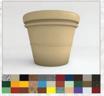
*For color names and clarification, please refer to PAGE 1 or visit WWW.TERRACASTPRODUCTS.COM

Classic Italian style Vase Planters are the most common type of planters seen in public. A traditional rolled rim design helps this pot maintain its timeless look.