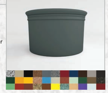
*For color names and clarification, please refer to PAGE 1 or visit WWW.TERRACASTPRODUCTS.COM

A simple rolled rim design, and one accentuating rim near the top of this planter make it ideal for graphics. This planter's limited taper makes its base outer diameter and top outer diameter nearly the same.