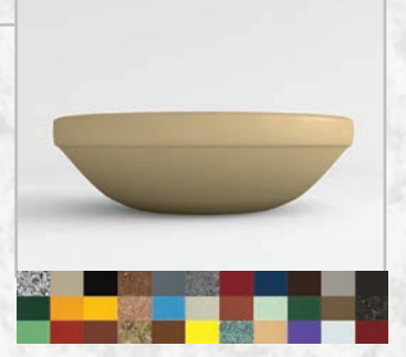
*For color names and clarification, please refer to PAGE 1 or visit WWW.TERRACASTPRODUCTS.COM