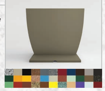
*For color names and clarification, please refer to PAGE 1 or visit WWW.TERRACASTPRODUCTS.COM