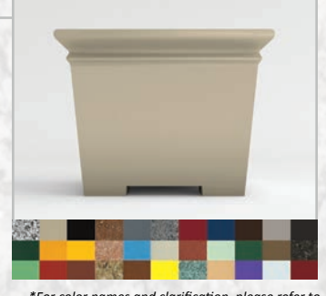
*For color names and clarification, please refer to PAGE 1 or visit WWW.TERRACASTPRODUCTS.COM

Easy for placement between furniture with its contemporary square design.