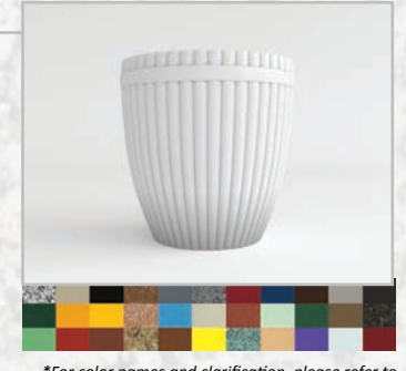
*For color names and clarification, please refer to PAGE 1 or visit WWW.TERRACASTPRODUCTS.COM

Compliments the Bamboo and Grooved Planter with a round, fluted, tapered design.