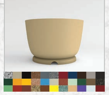
*For color names and clarification, please refer to PAGE 1 or visit WWW.TERRACASTPRODUCTS.COM