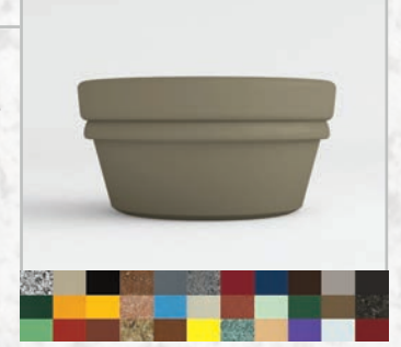
*For color names and clarification, please refer to PAGE 1 or visit WWW.TERRACASTPRODUCTS.COM

Great compliment to Vase and Garland Planters with its round, rolled rim, cylindrical, low profile design.