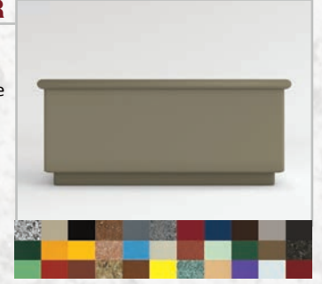
*For color names and clarification, please refer to PAGE 1 or visit WWW.TERRACASTPRODUCTS.COM

Impressive pedestal style, rectangular planter that really drives the Italian theme. Available with or without garland.