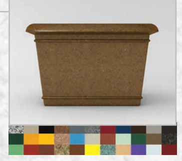
*For color names and clarification, please refer to PAGE 1 or visit WWW.TERRACASTPRODUCTS.COM

Similar look to Californian style planter, but in rectangular shape. Used as outdoor cafe' separation and decoration.