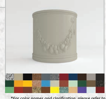
*For color names and clarification, please refer to PAGE 1 or visit WWW.TERRACASTPRODUCTS.COM

The Mediterranean rolled rim design on this Half Round planter allows layouts around walls, furniture and in combinations to create full circles. Available with and without garland.